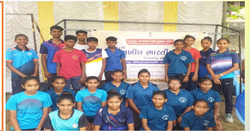
Winners at School Games

Buoyed by the success of the medical stream, MECT now embarks on a mission to promote sports as a career for gifted students. Starting with 25 students, the sports quota for gifted students will grow to 100 by 2026. A partnership with Dani Sports Foundation has been forged for providing professional coaching to sports educators and co-developing a PE curriculum that is engaging for students across grades and potential.