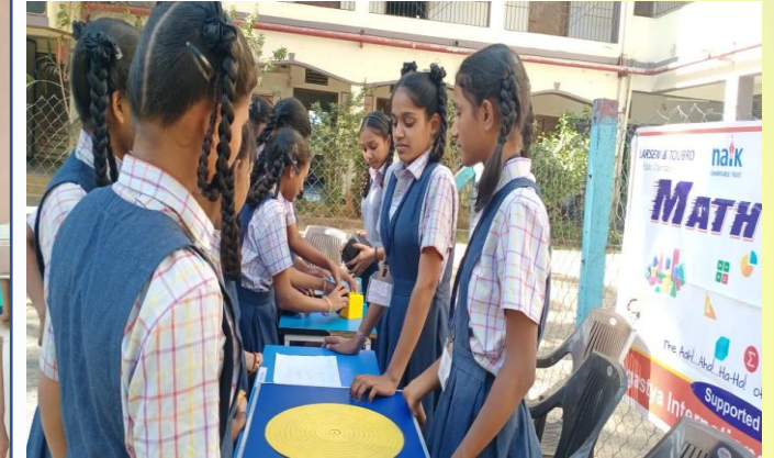
@ L&T Foundation Innovation Fest