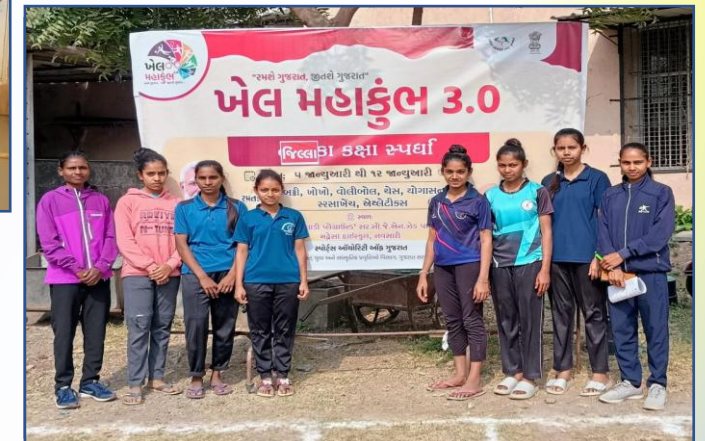
Winning at Khel Mahakumbh at the Speed Walk event