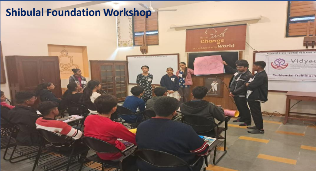
Shibulal Foundation Workshop