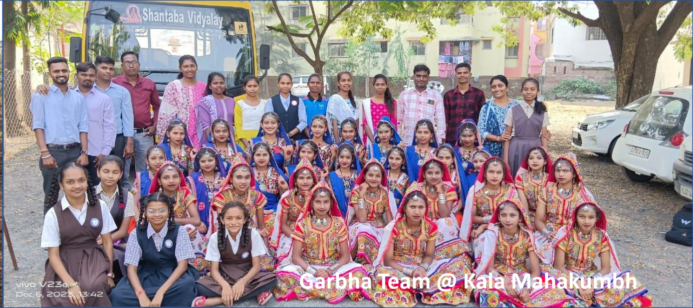
Garbha Team @ Kala Mahakumbh