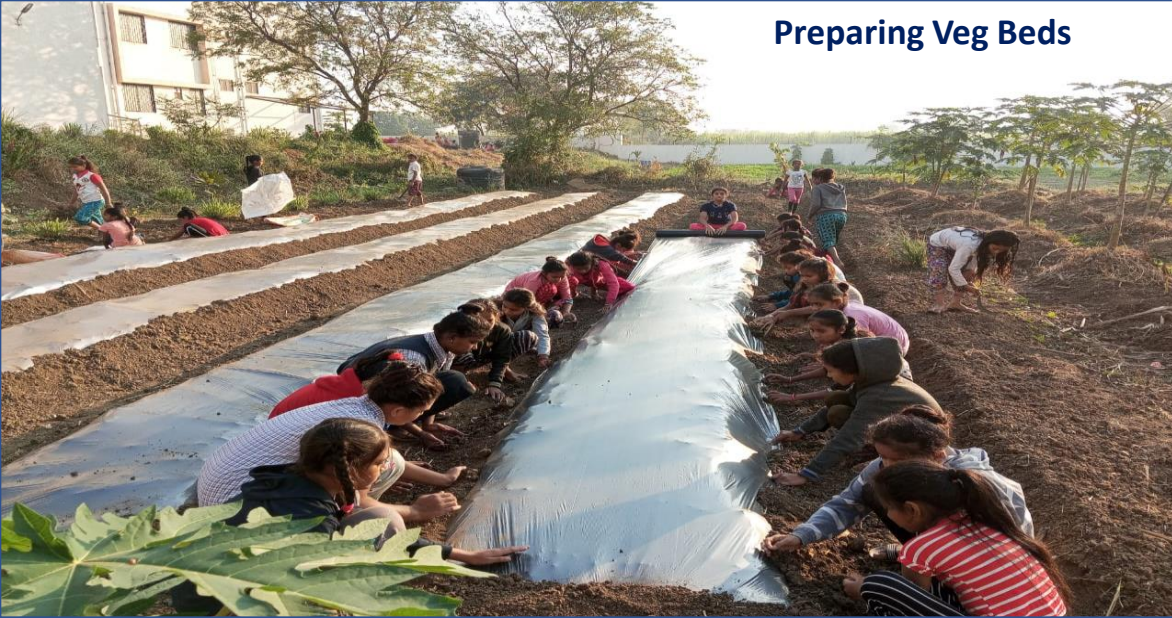
Preparing Veg Beds