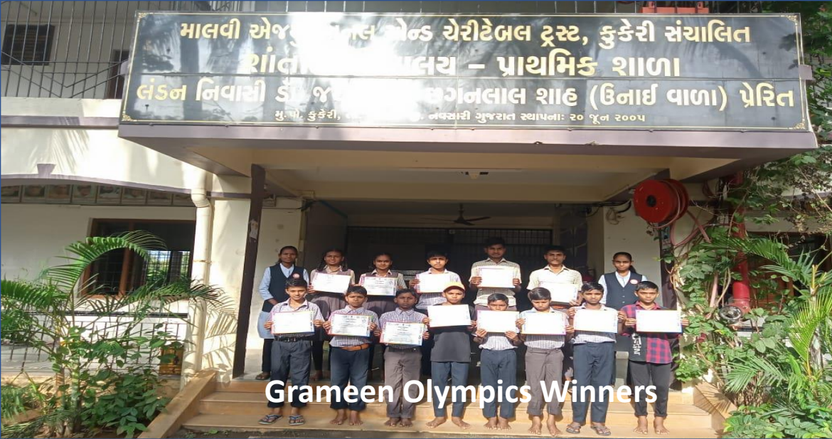
Grameen Olympics Winners