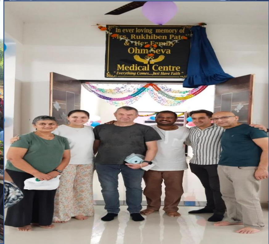
Inaugurated a new girls hostel in Dec - by Shri Kanubhai Desai (Finance Minister - Guj) Members of the Ríjnevald Family inaugurating the new Nursing Center