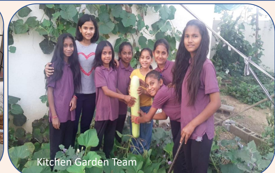
Kitchen Garden Team